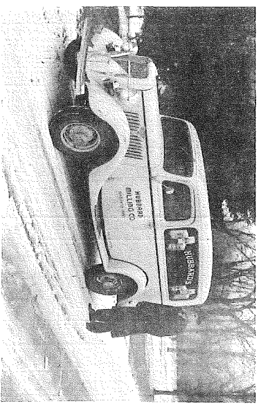
Hubbard's "Thrifty Five" products were manufactured and distributed throughout the area prior to WWII.