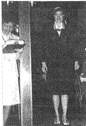
1990's Executive Business Suit