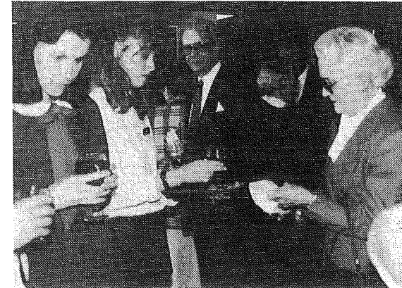
1990 Heritage Dinner