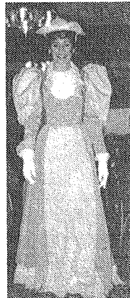
1895 Reproduction Traveling Suit