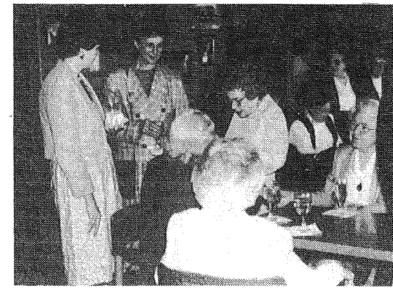
1990 Heritage Dinner