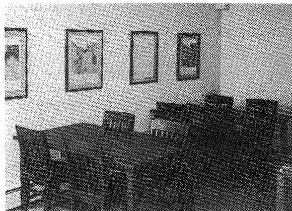
Heritage Center: Archives/Map Room June 1989.

The July session of the Blue Earth County Cemetery Project will be held on Wed., July 19, or in case of rain on the following Wed., July 26. Participants should meet at the Heritage Center parking lot (415 Cherry St., Mankato) at 8:30 a.m. to carpool to the cemetery. Call Audrey at 507/345-5566 for more information.