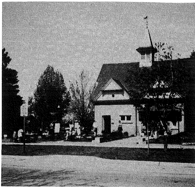
The gardens surrounding the Carriage House were the location of the May plant sale sponsored by the Historical Society.

Thanks to those members and friends of the Society who donated plants, potting soil, planting pots, money, and volunteer time. We appreciate the support of those who attended the sale and encouraged their friends, relatives, and neighbors to purchase plants as well. Plans are underway to make next year's sale even bigger.