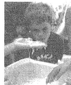
L to R - Rhubarb and cotton blended to make paper pulp. / Drying sheets of paper made from handmade paper pulp.