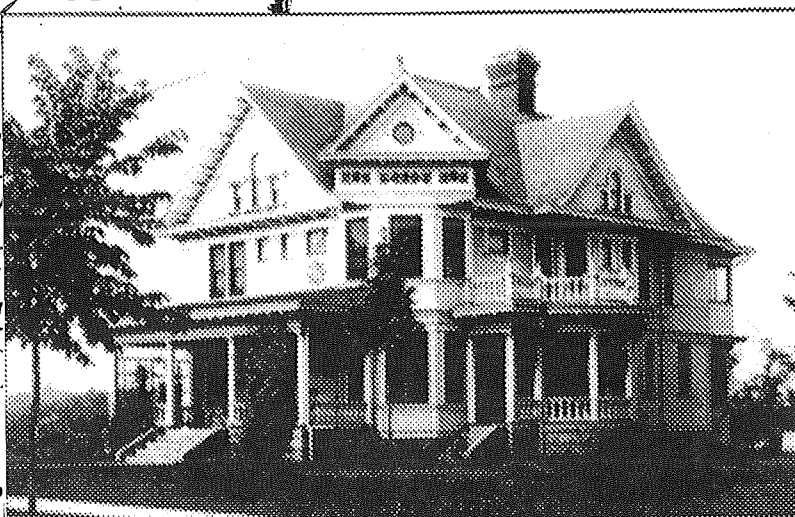
Constructions Specifications and photo of Brandrup House property of Blue Earth County Historical Society