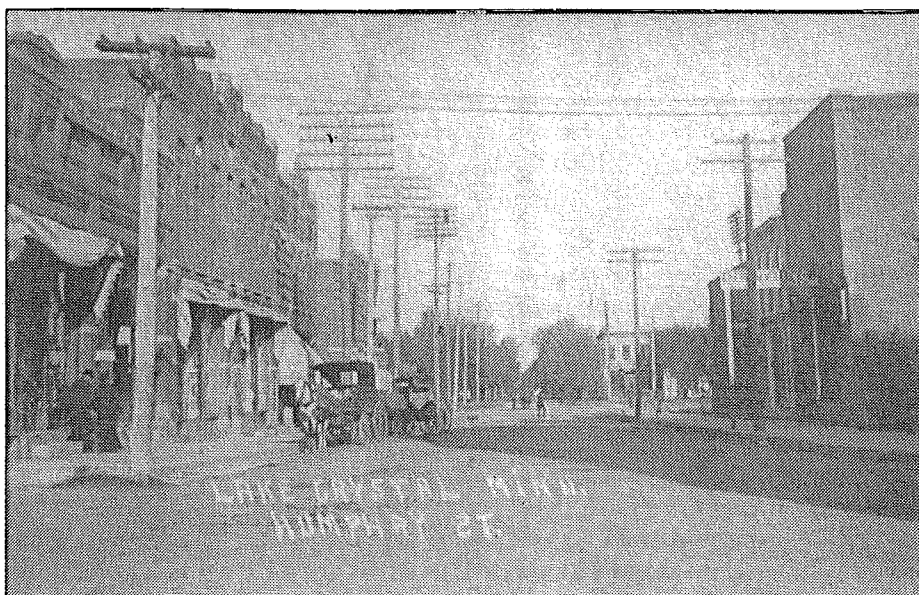
Humphrey Street - ca. 1905

purposes, is pumped through a system of mains, reaching practically every quarter of the village. On the shore of Lily lake has been laid out a cosy little park, amply equipped with benches, tables and all the customary paraphernalia, including boat houses on the