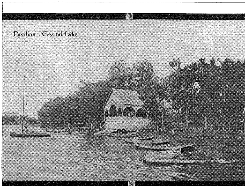
Pavilion on Crystal Lake - July 1893

hundred wide-awake, spirited, apprehensive and ambitious people. This region furnishes an ideal summer resort. The tourist finds health and recreation on the lakes and among the hills, and the village can secure all the necessities for the comfortable maintenance of life and the pursuit of rural pleasures. The residents are all alive to the fact that Lake Crystal can be made a center of interest to overworked rest seekers in all the country