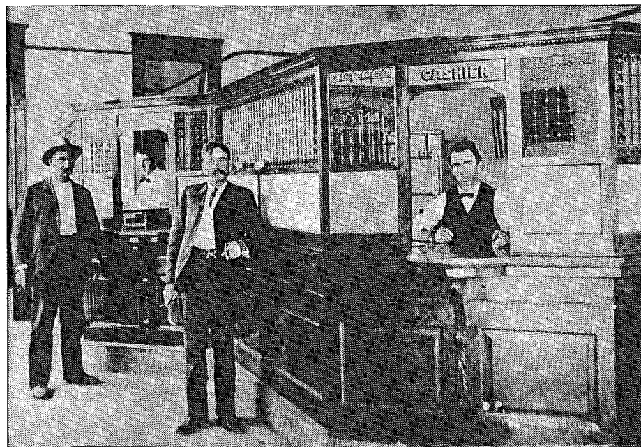
First National Bank - ca. 1903

In 1902, Lake Crystal passed a bond issue and built a new brick structure which cost $22,000. School enrollment at that time was 333 students.