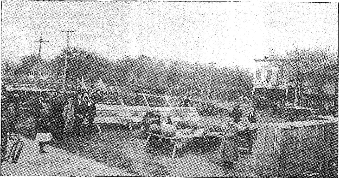
Life in Lake Crystal - date unknown