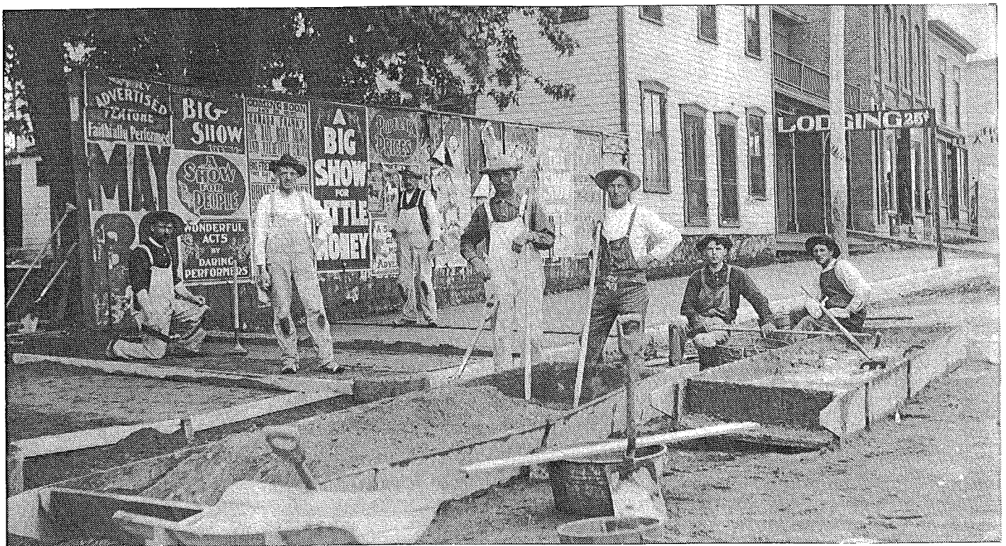
Making Cement Sidewalks in Lake Crystal