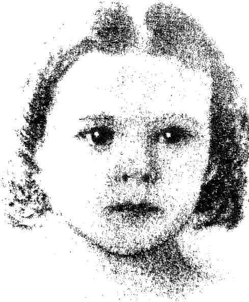
"Daisy" Juliette Gordon Low