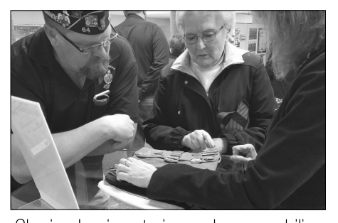
Sharing Legion stories and memorabilia at the exhibit opening.

on view throughout the summer. Here's to the first 100 years of service to our veterans, the community and a million stories strong!