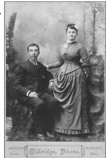
An unidentified wedding photo from Eldridge Photo, Mankato

Historic photographs are great for showing how places change over time. but they can also help put a face with a name you may have only "met" in vour research. That's why it's important to label photographs with whom is in the photo, where it was taken and a date. Without this information, the image can mean very little. But if you discover a photo of your great aunt and uncle on their farm, you are instantly connected to the image