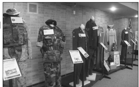
The uniforms on display all belonged to Blue Earth County servicemen who were also proud Legion members.

The exhibit features photographs and six military uniforms dating from World War I and ending with Operation Enduring Freedom. The uniforms represent the