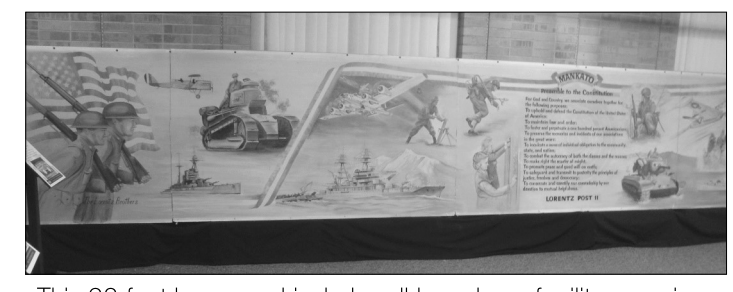
This 28 foot long mural includes all branches of military service.

This exhibit explores the history of the