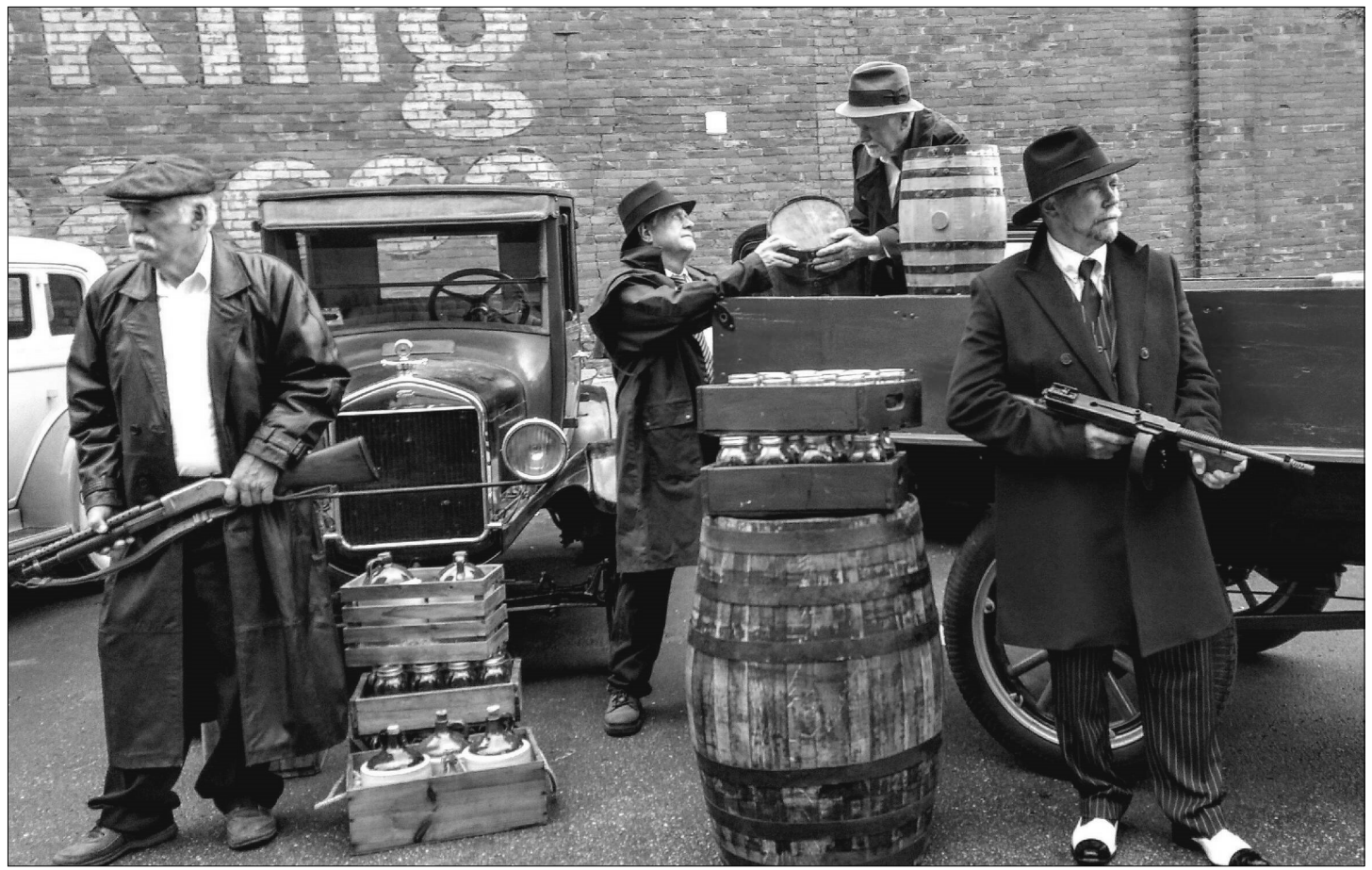
Prohibition re-enactors keep a close eye on their moonshine.