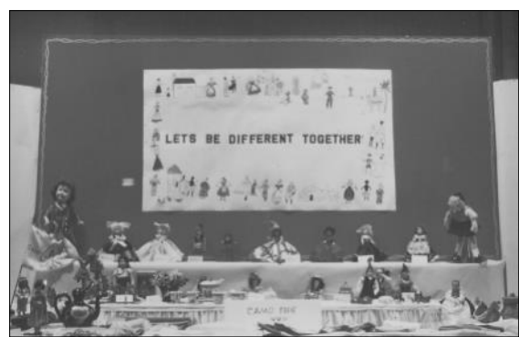
"Let's Be Different Together" Birthday Week display

also emphasized throughout the year. In 1953, for example, the theme was "Down to Earth." The girls tended to their own patch of earth and learned the value of natural resources and how everything eventually depended on the soil.