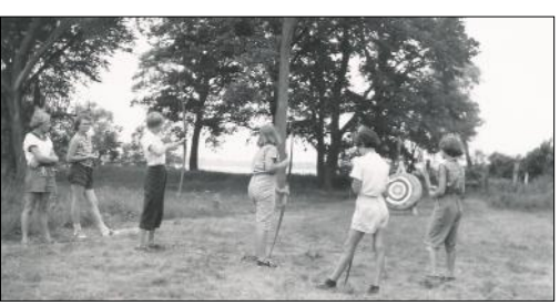
Archery was just one of the many activities the girls enjoyed at camp each summer.

The week-long camp was full of your typical camp activities. The girls learned how to pitch a tent, tie knots, waterproof matches, trail blazing and fire building. They also learned several ways to cook over the fire. A favorite were "breadsticks" – Bisquick dough wrapped around a stick and baked over the fire. Marcia (Jones) Richards' best camp memory was