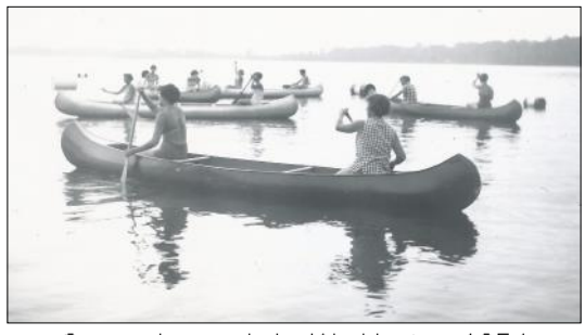
Canoe class on Lake Washington, 1954.

Camp Fire Girls opened up even more travel for Kay when she and four girls traveled to