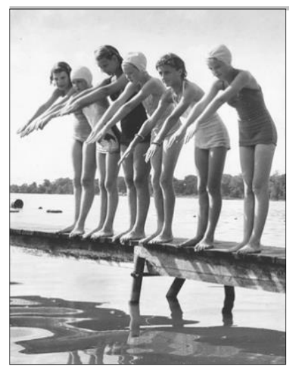
Swimming was a big part of every summer camp. The girls could earn honor beads as well as Red Cross certification.

dancing, scavenger hunts and talent shows were just some of the camp activities through the years.