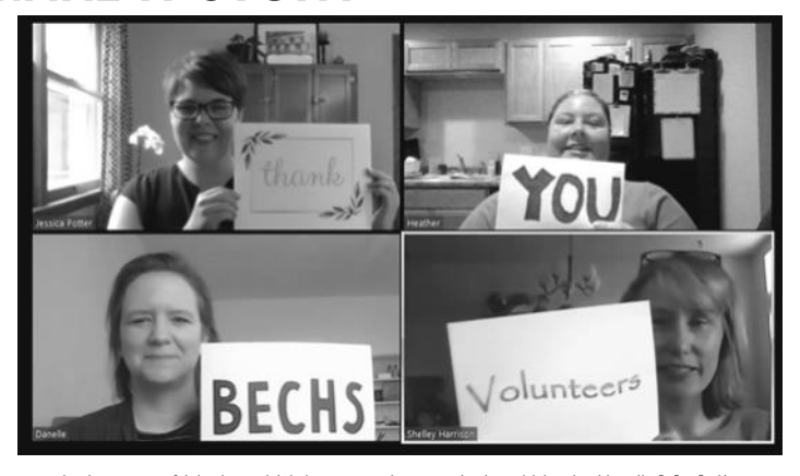
In honor of National Volunteer Appreciation Week (April 20-24), BECHS staff (working remotely) shared appreciation for BECHS's amazing volunteers!

Email museum@blueearthcountyhistory.com if you have any questions.