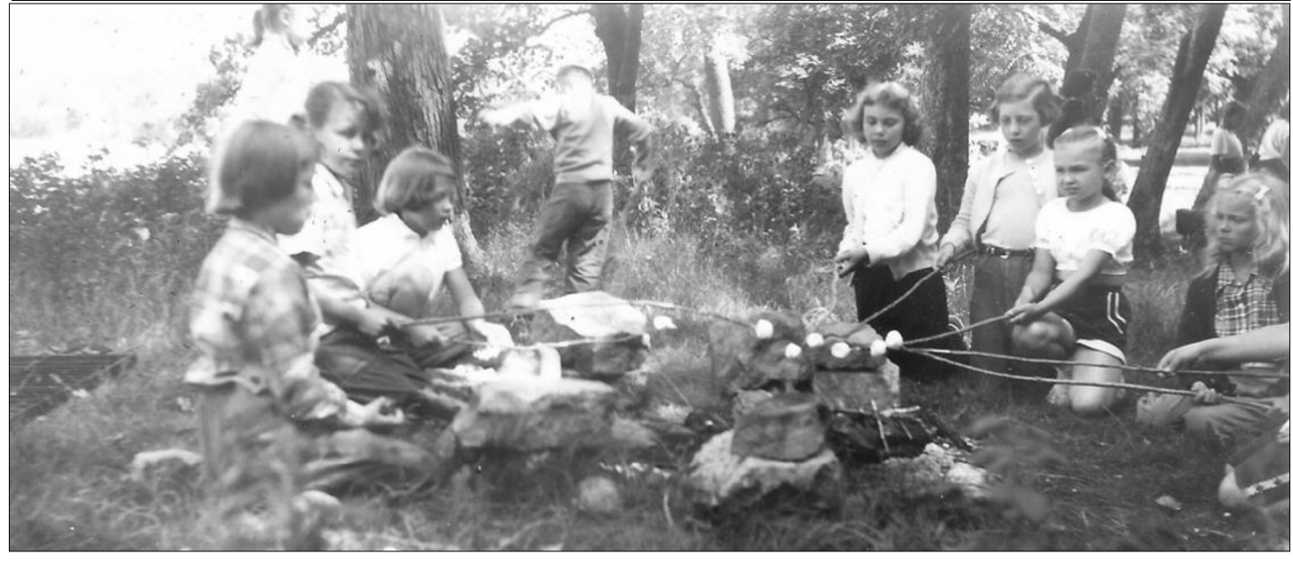
It's anyone's guess how many s'mores were consumed each summer as the Camp Fire Girls took over Camp Patterson, July 1954.