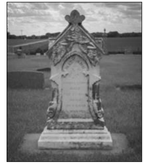
ART GALLERY Tombstones of Blue Earth County

BECHS BLUE EARTH COUNTY HISTORICAL SOCIETY 424 WARREN STREET MANKATO, MN 56001