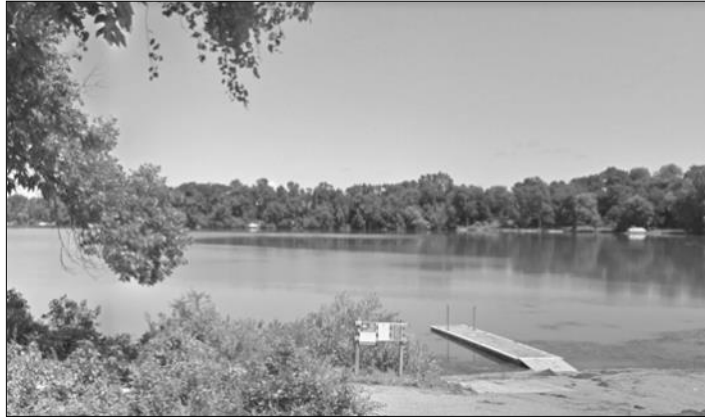
Lake George boat ramp in Madison Lake

When was the last time you visited Bray Park or Duck Lake Park on Madison Lake? Ever seen Minnemishinona Falls on Judson Bottom Road? Have you been out to Williams Nature? Did you know Minneopa State Park was the third State Park ever created in Minnesota? Ever visited Shimek Park near Good Thunder? With Rapidan Dam in the news, it's a great time to see the Dam and visit Rapidan Dam Park. The Blue Earth County Fair is located in a park surrounded in oak trees. Blue Earth County staycation ideas abound when we look at our parks and trails. Mankato city parks includes Riverfront Park, Land of Memories Park and Campground (home to the Mahkato Wacipi September 16-18), Tourtellotte