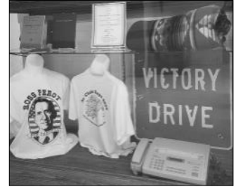
Blue Earth County: 120 Years, 120 Stories